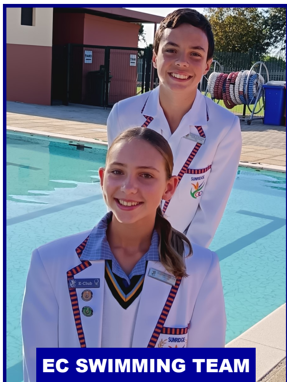
EC SWIMMING TEAM