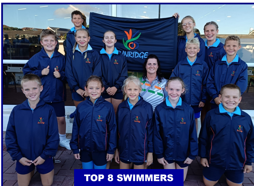
TOP 8 SWIMMERS