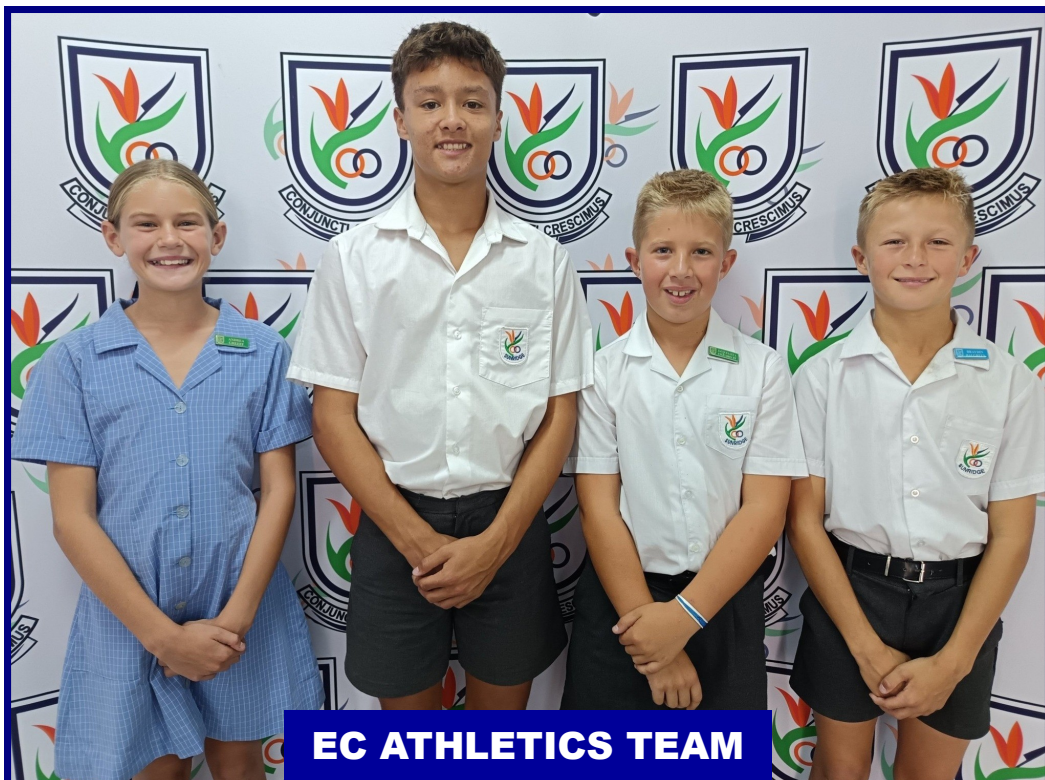
EC ATHLETICS TEAM