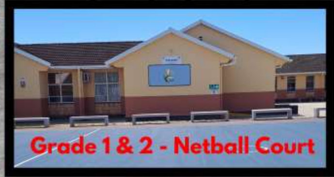
Grade 1 & 2 - Netball Court