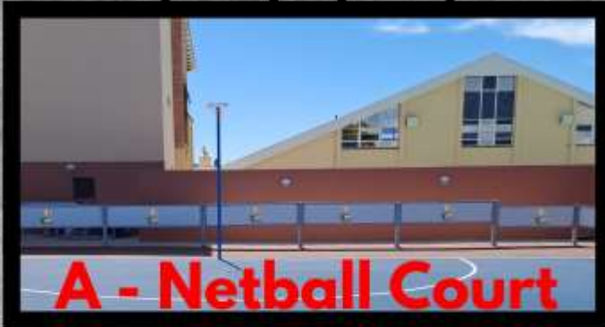
A - Netball Court