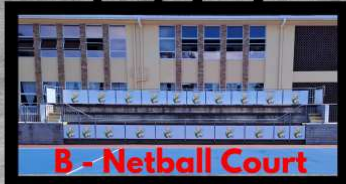
B - Netball Court