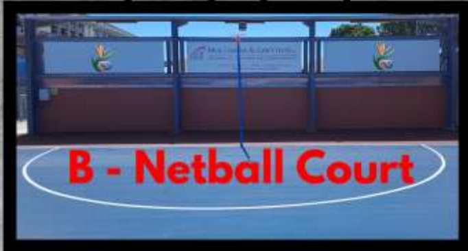
B - Netball Court